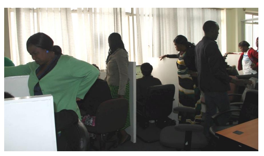
Epworth women working on their blogs in Media Centre offices, May 2014.

Spending on the project broadly followed the budget outlined in the project document, though some relatively minor changes were made. The main single heading of the budget was for meetings and training sessions (61% of the budget). Some of the activities, as mentioned above, were of relatively little relevance to the needs of marginalized women (internships, media monitoring). These represented about 3% of the total budget. Similarly, the