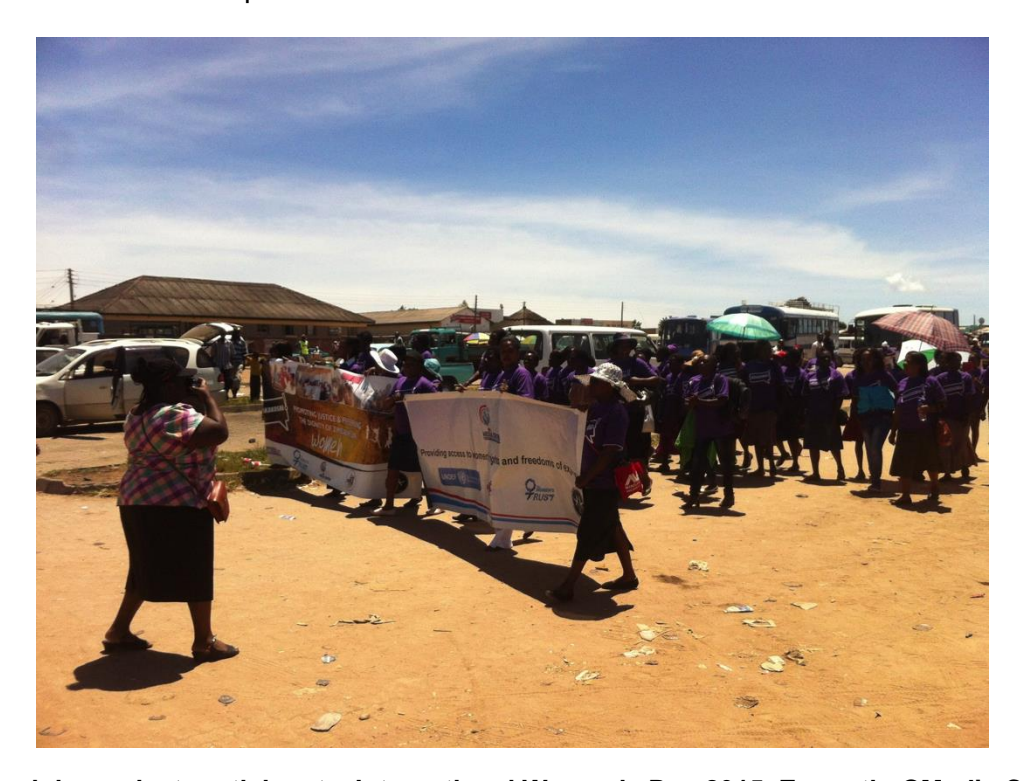
March by project participants, International Women's Day 2015, Epworth.

The Media Centre was formed in 2010 and set itself the mission of working with media and civil society to "enhance professional journalism, support increased access to information and facilitate progressive public debate". Its vision is of an "open and accessible media for an open society". Amongst its functions, the Media Centre conducts training of journalists, citizen journalists and media students and provides a platform of debate on policy issues and citizen journalism in local communities through the use of information communication technology amongst other issues. Most importantly with regard to this project, the Media Centre assists marginalized communities in accessing information and telling their stories through electronic media, social media and other platforms.