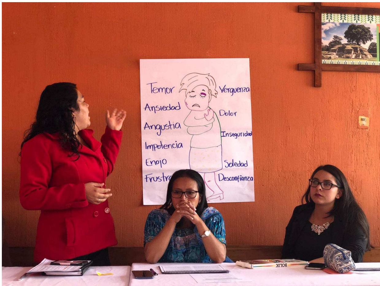
Training of service providers

"We find that women don't seek legal services just because they exist... there's not an understanding of what protections exist and what their rights are and nor is there a recognition of individual women as valued members of a community who have rights... the legal literacy component and empowerment piece of it around self-esteem and communication is really critical to ensure women... not only know their rights but begin to use and shape the law too. –WJI Executive Director