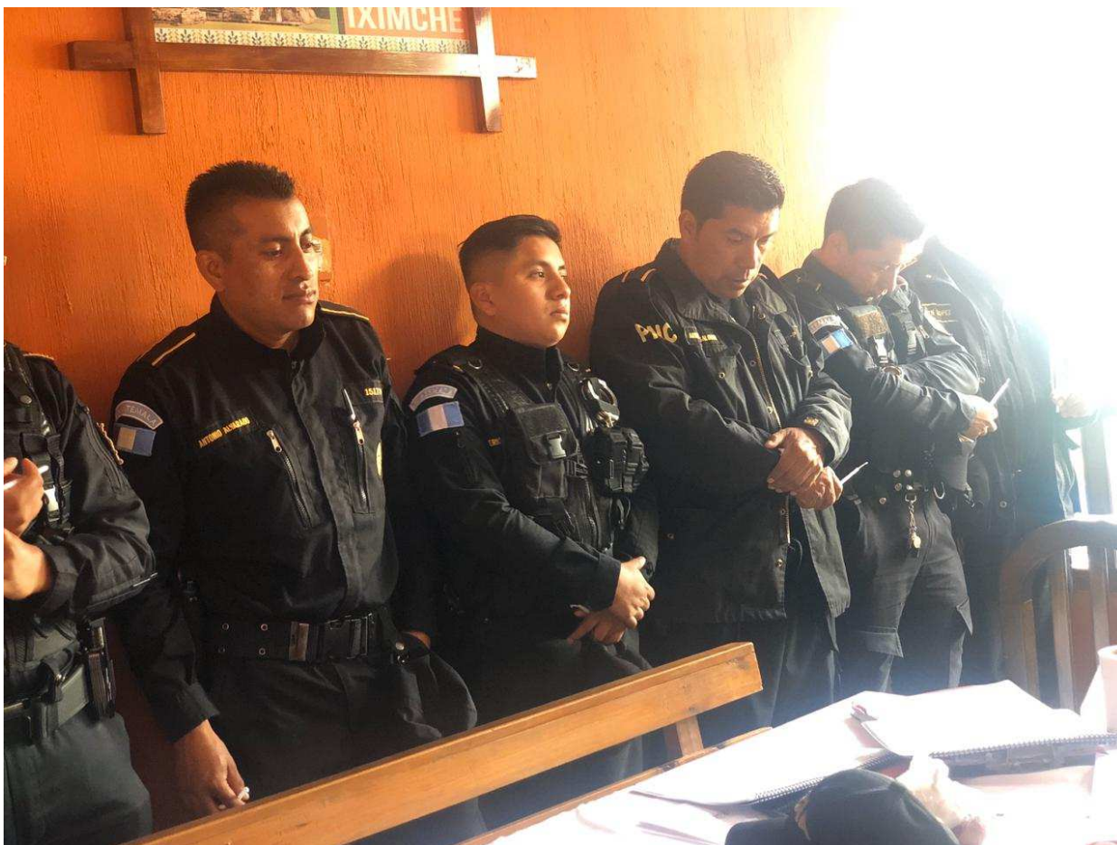
Training police officers

“I coordinate with [the project’s paralegal], I have a space for her in my office so that we can coordinate. They refer cases to me from Chimaltenango, from the Justice for cases of femicide to support victims... WJI helps me a lot because there are times when I say to her, ‘What do I do?’ What can I do and what can you do?’ and she says to me, ‘I will help the woman’ and she takes the case, which helps me a lot” –Director of the DMM