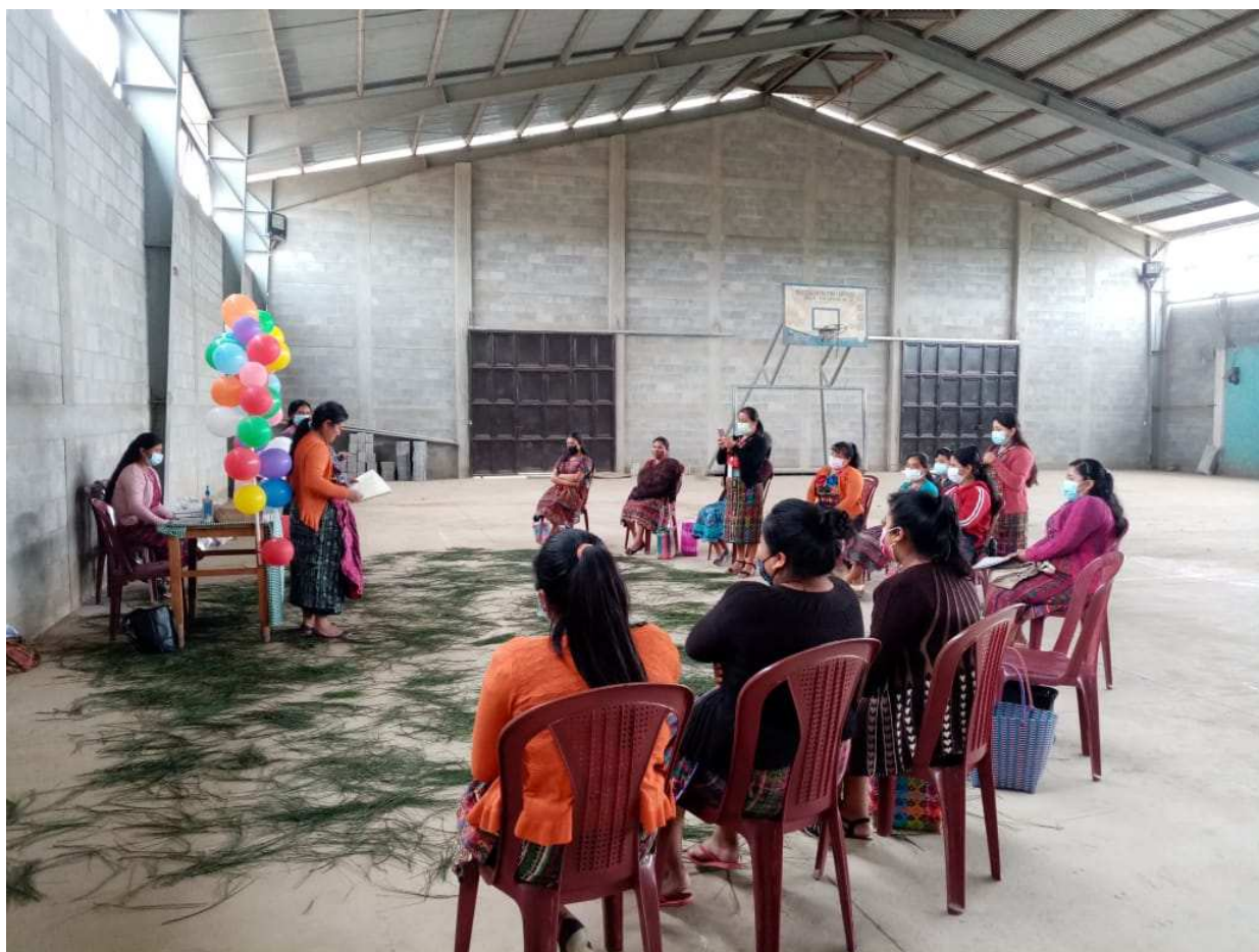
Culmination ceremony for the Women’s Rights Education Program

“We need psychological services for victims because they are traumatized, and they stay that way. We don’t offer recovery services for the victim; this is lacking in the service.” –DMM Director