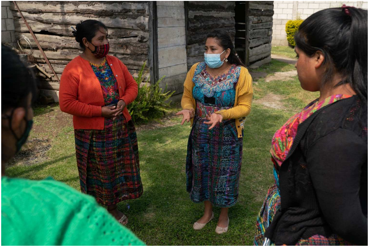
Community advocates sharing information with women in their communities

“Usually, you see a slow uptake in legal services over the period of the project... it takes a while for women to begin using our services. That was not the case in Tecpán, we saw referrals right away from service providers, we saw women further along with their cases and needing more comprehensive legal support” –WJI Executive Director