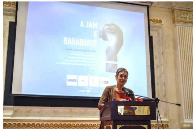
Ulrike Lunacek, former Member and Vice President of the European Parliament, prominently supported the launch conference

In line with the wider purpose of the activities under this project component the baseline and end-of-project surveys were measures designed to analyse the level of public awareness and knowledge concerning key gender issues. Accordingly, both surveys were meant to be held among citizens living in the 11 municipalities targeted by the grantee's network of local radio stations. The surveys were to be designed by implementing partner KGSC, to be conducted by the INC Media Network Team among 100 respondents per municipality, and their results were meant to be used for discussion during the project's launch and final events and impact analysis of the project's media programme impact analysis. A two-day launch conference for 30 participants promoting active involvement in and inputs from women NGOs, public authorities, and the media was expected (a) to consider the results of the previous survey, and (b) to review the possible content and discuss details of the media programs.