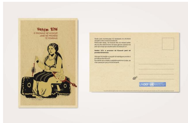
Project postcard image displaying traditional folk elements and the message "Only 10% of property is held by and in the name of women"

As far as the second media package of radio jingles, TV spots and flyers and posters are concerned it appears that the concept of short duration, poignant imagery, and concise messaging was particularly effective to inform and to change community attitudes and behavior in the context of domestic violence and to encourage increased reporting of cases of violence and abuse. All 11 partner stations participated in the dissemination of the TV and radio messages in three languages, which provided e.g. statistical facts from the project's survey, and information about the steps to be taken by police when a complaint was filed.