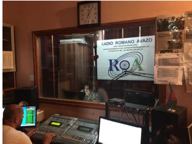
Programmes in Prizren focused on access to jobs and medical services for early married Roma women victims of domestic violence

criterion for purposes of impact analysis, while all other data was used to inform discussions at the project's launch and final events separately. The two-day launch conference was held from 21 to 22 April 2015, involving high-level participation and contributions by more than 40 (planned: 30) persons, among them the President of Kosovo, the Vice-President of the European Parliament, and representatives of international organisations, women NGOs, public authorities, and the media. The event, which was covered by radio, TV and print media, considered the project's initial survey results and made a number of recommendations supporting the project's outcomes, most importantly the need to permanently allocate municipality budgets with funding for shelters for women victims of domestic violence and to introduce clear law and implementing rules addressing sexual harassment in the workplace.